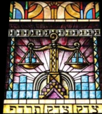
Scales of Justice